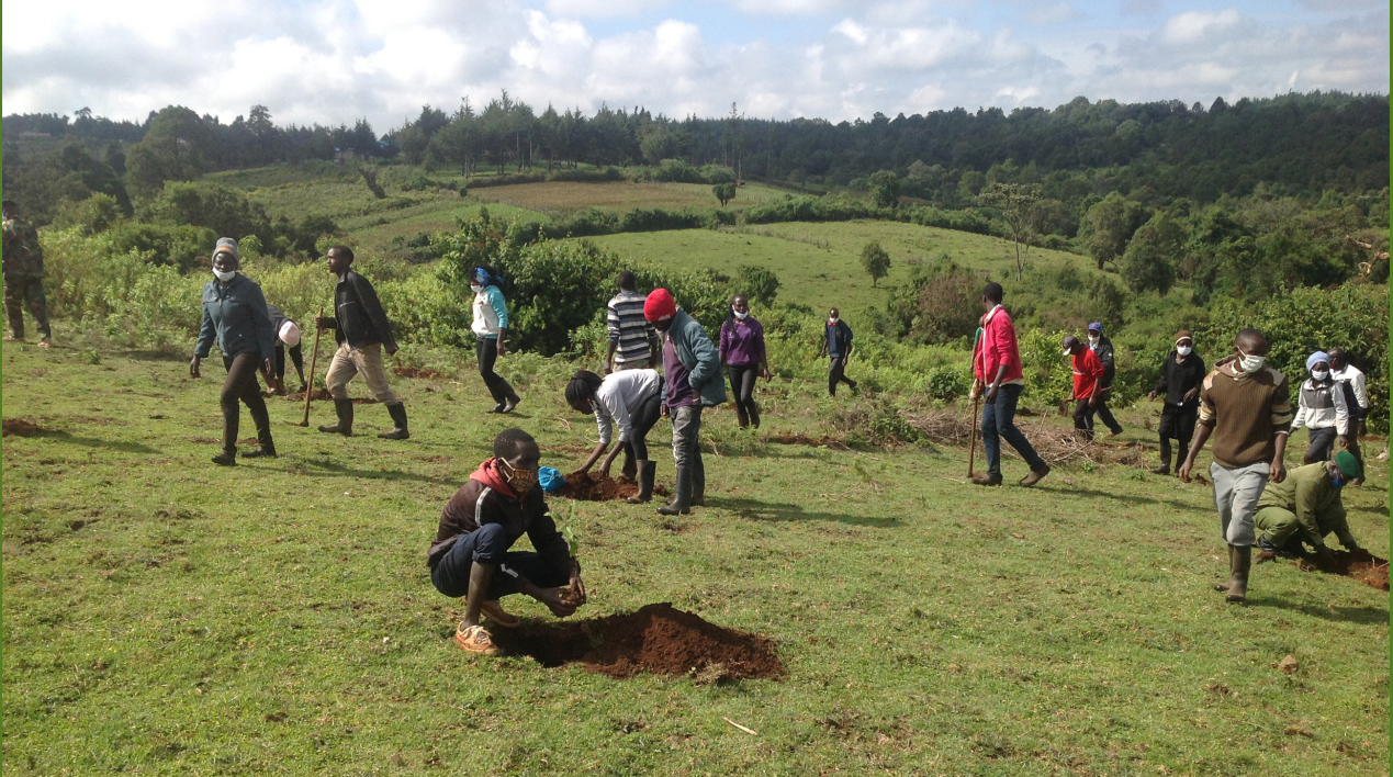
Communities living adjacent to Embogut forest, Elgeyo Marakwet plant trees to rehabilitate the forest

Kenya Forestry Research Institute (KEFRI) Headquarters Muguga, off Zambezi, Nairobi - Nakuru Highway Tel: +254 724 259 781/2, 722 157 414 E-mail:director@kefri.org, Website:www.kefri.org