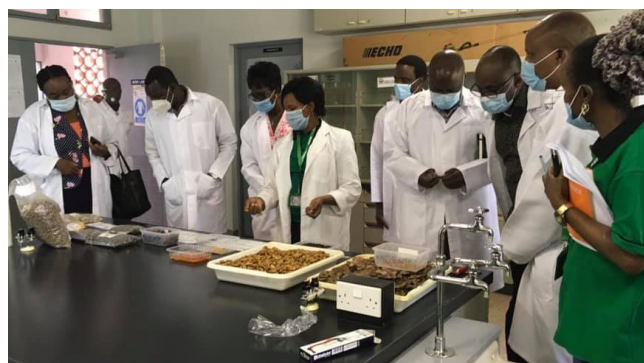
KEFRI Board of Directors tours research facilities