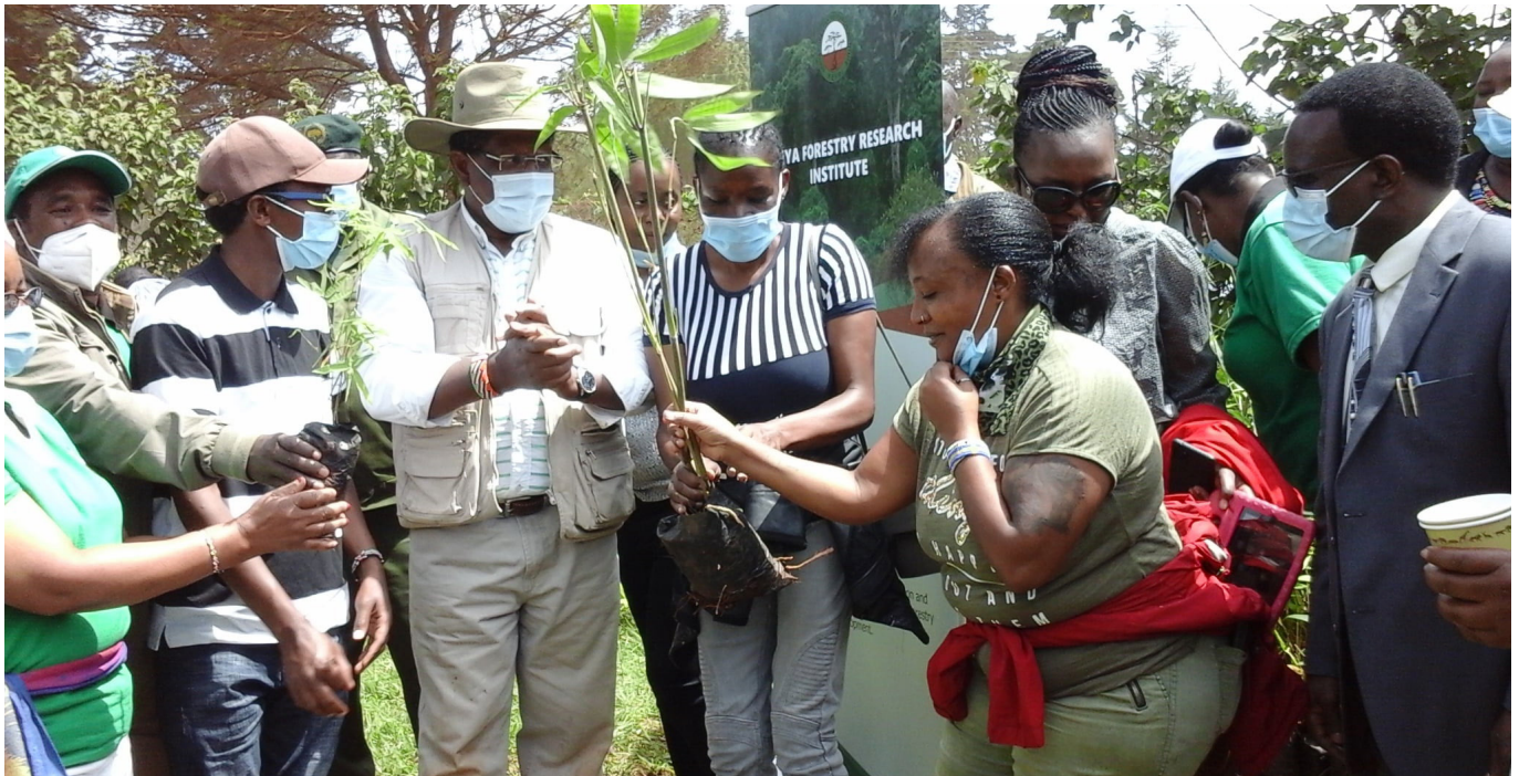
CS, Keriako Tobiko during bamboo planting at St. Pauls University grounds