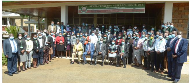
KEFRI management and new employees at the induction workshop

The Director also praised outgoing staff for laying a firm foundation and urged the new staff to establish good rapport with their mentors as it improves individual and corporate performance.