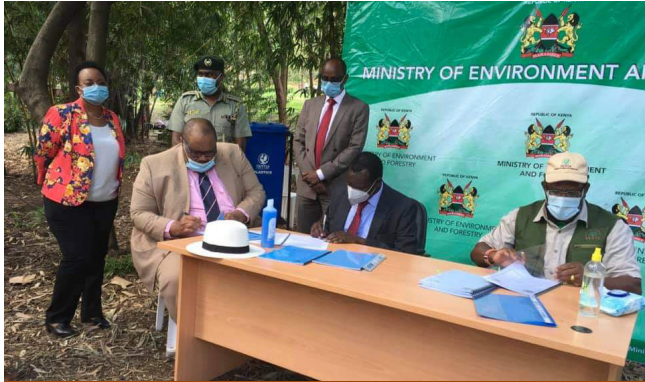
The CS Environment and Forestry signs the KEFRI Performance Contract for 2020/2021 Financial Year with the Board Chairman at Michuki Memorial Park