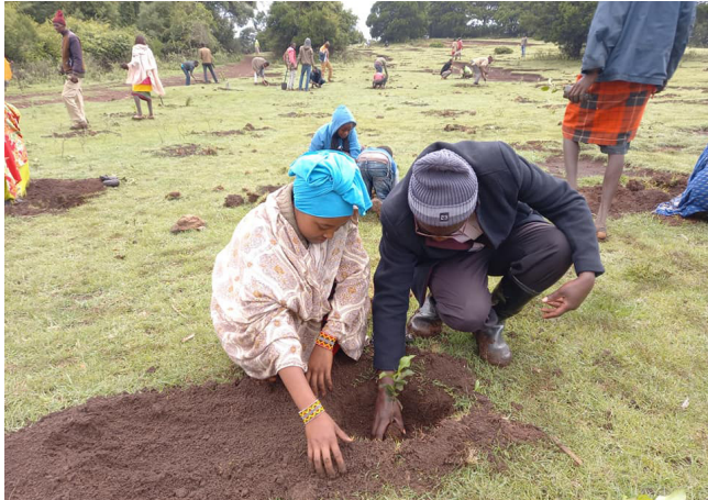
Community members in a voluntary tree planting activity to conserve degraded sites in Mt. Kulal forest

Food and Agriculture Organization (FAO) in collaboration with the Ministry of Environment and Forestry, KEFRI, KFS, NMK, NEMA and Marsabit County Government, embarked on rehabilitation of Mt. Kulal, Marsabit County.