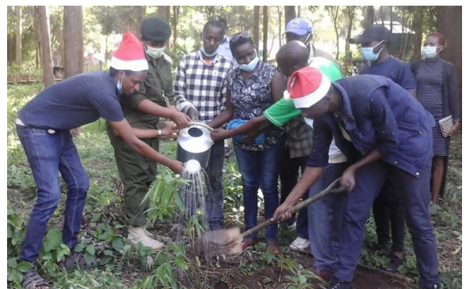
Officials of Rescue Ghetto Kids Mission planting Bamboo at Michuki Memorial Park

In Kenya, bamboo farming is gaining popularity due to high demand for timber and other construction materials, its diverse uses in agriculture and as a food crop for both humans and animals.